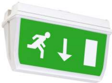
Optional: trapezium shape diffuser