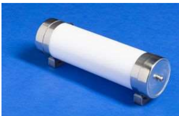
TUBE EM LED

Ideal for weatherproof IP65 or emergency use.