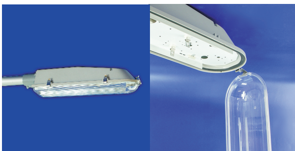
Side-entry (dia 42 upto 60) mm)